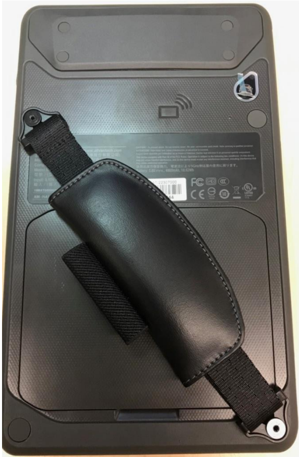
-AIM-35/55/65AT Tablet PC