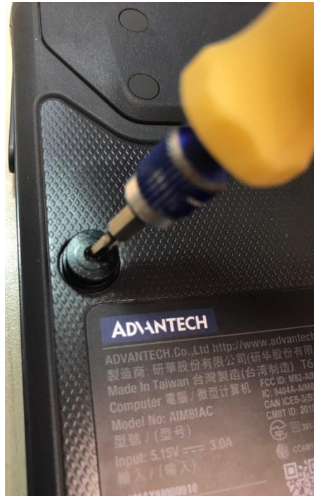
-AIM-35/55/65AT Tablet PC