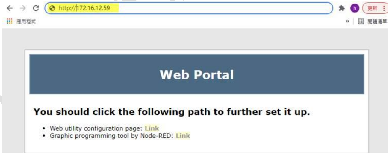
Figure 1. Log in page with Http protocol.